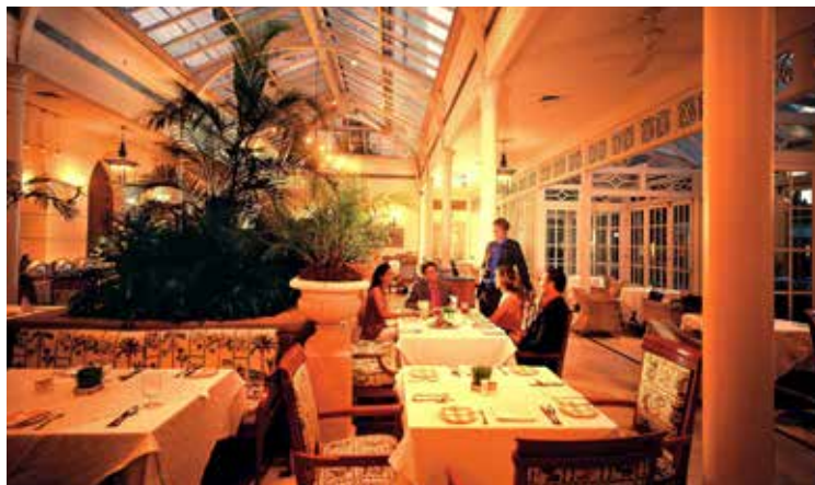
Raj pavilion – ITC Windsor, Bengaluru