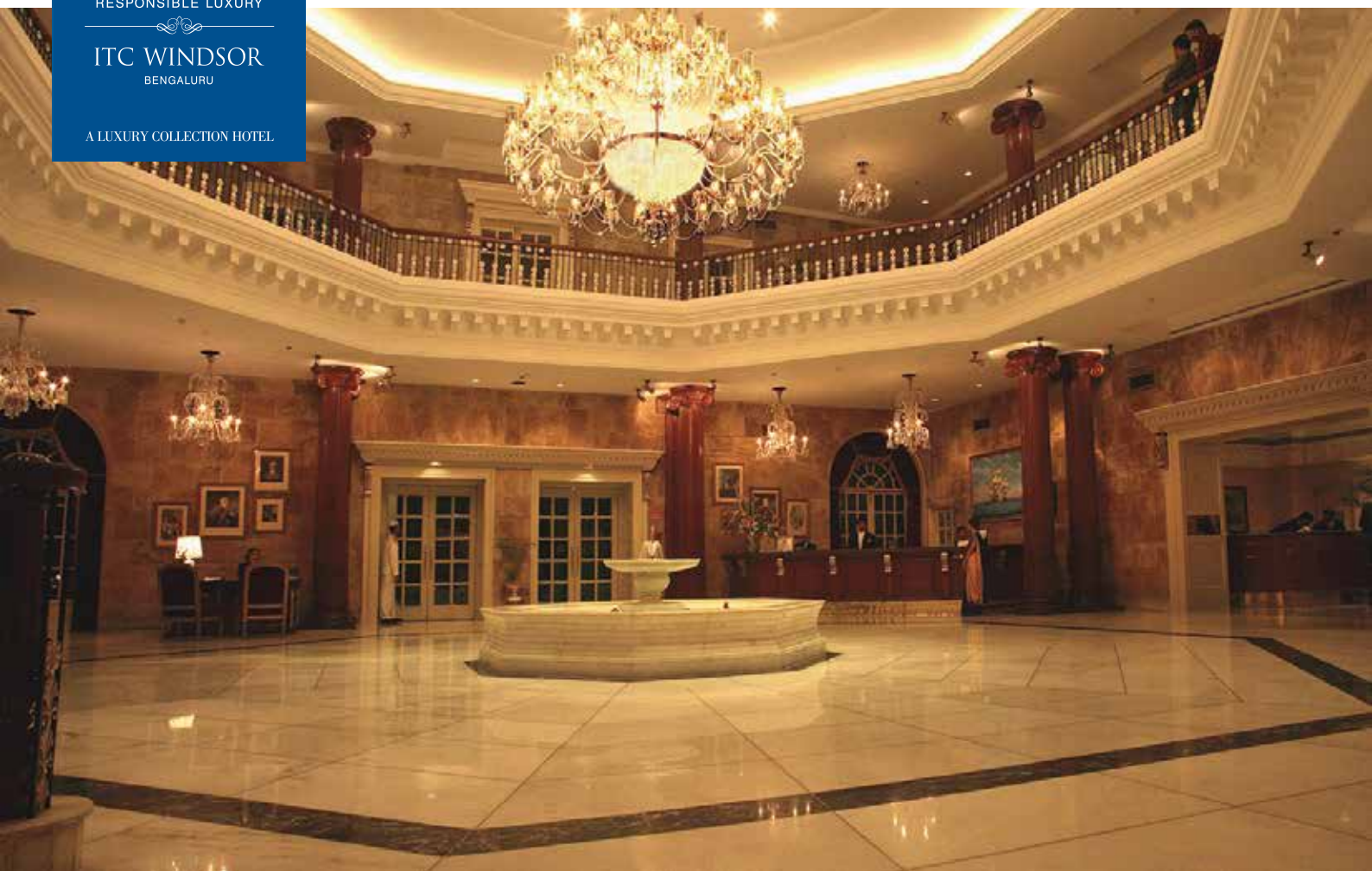
Lobby-Arcot Hall – ITC Windsor, Bengaluru