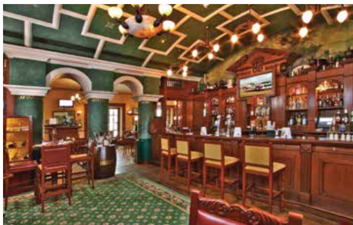
Bar View, Dublin – ITC Windsor, Bengaluru