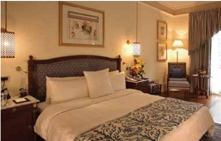
Executive Club – ITC Windsor, Bengaluru