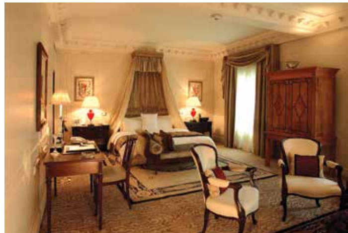
Presidential Suite – ITC Windsor, Bengaluru

The abode of aristocracy, spread over 161 m 2 , this luxurious suite has a kitchenette, dining room, bar, living room with two distinct seating areas, library and a king sized bedroom. The Presidential Suite boasts an exclusive terrace which is perfect for hosting private dinner parties for space 20 people. The sheer luxury of the Presidential Suite has played host to several illustrious and distinguished guests and world leaders, ex-British Prime Minister, Rt. Hon. Tony Blair, former German Chancellor, H. E. Gerhard Schroder, His Holiness the Dalai Lama, Sir Elton John, The Chinese Premier – H. E. Mr. Wen Jiabao, H. E. Ferenc Gyurcsany – former Prime Minister of The Republic of Hungary and Madam Klara Dobrev.