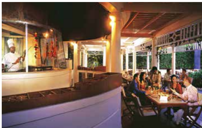
Royal Afghan by Night – ITC Windsor, Bengaluru