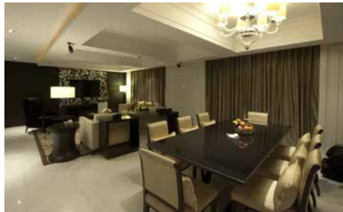
Presidential Suite – ITC Kakatiya, Hyderabad

The ultimate luxury paired with impeccable personalised service, the Luxury Suite and Presidential Suite redefine luxury and leave you craving for more.