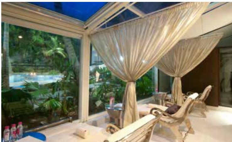
Poolside Cabanas – ITC Kakatiya, Hyderabad

We take pride in our unique range of spa services dedicated to your complete well-being. Our special selection of treatments cater to the skincare needs of both men and women, and our diverse blend of treatments are a mix of highly regarded Asian and European health and beauty enhancement therapies including facials, exfoliating treatments, traditional remedies and massages.