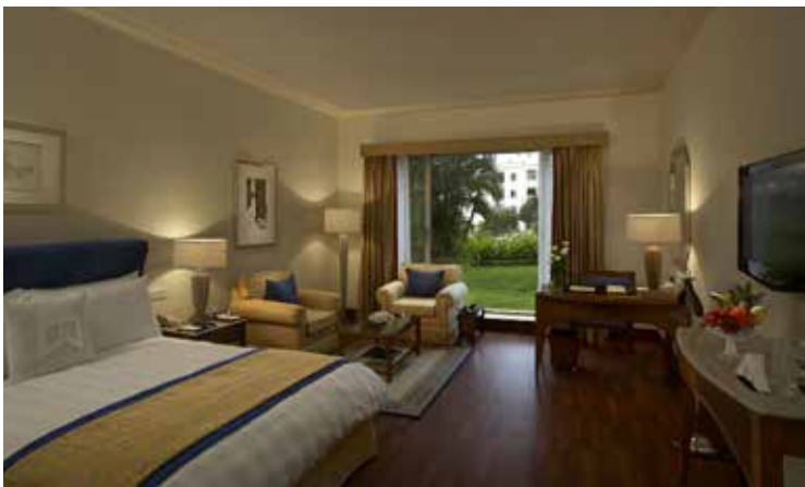
Executive Club – ITC Kakatiya, Hyderabad