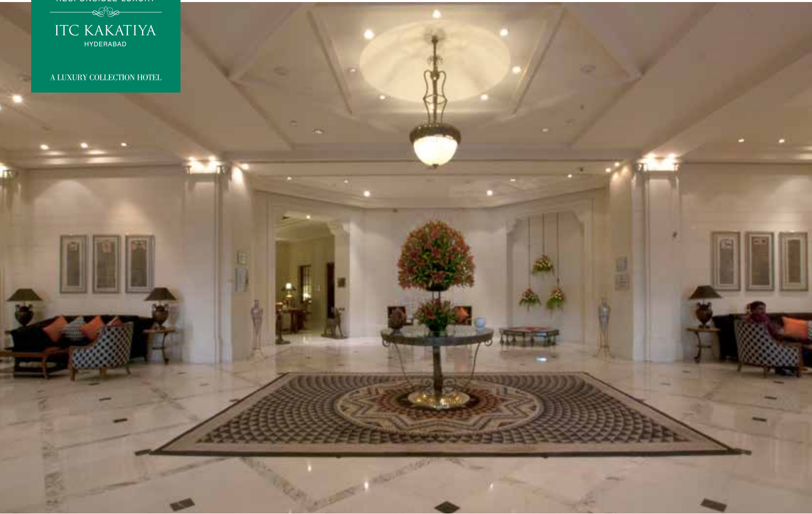
Lobby – ITC Kakatiya, Hyderabad