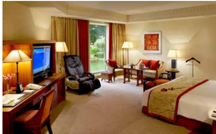
ITC One – ITC Kakatiya, Hyderabad

The concept of a 'Hotel within a Hotel', The Towers at the ITC Kakatiya spell the ultimate in hospitality, privacy and comfort for the global business traveller. From an exclusive check-in to personalised valet and butler services, the exclusive Towers Club Lounge is at your service round the clock. Combining the best of luxury and service standards, these rooms offer the grandeur of space with an air of quiet understated elegance.