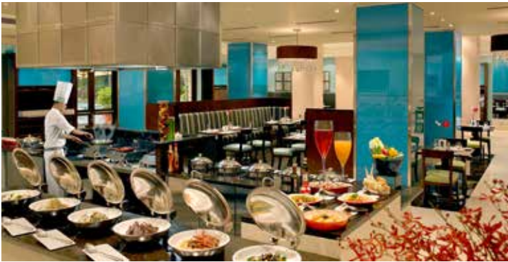
Luxury Breakfast Buffet at the Deccan Pavilion – ITC Kakatiya, Hyderabad

The Deccan Pavilion is a 24-hour multi cuisine restaurant with a difference. The restaurant serves 'mood cuisines' catering to every mood round-the-clock from a range of cuisines. It has a wide multi cuisine buffet spread for lunch and dinner apart from à la carte. It has not only the finest breakfast, lunch and dinner buffets, but also the most delectable selection in its all day dining menu.